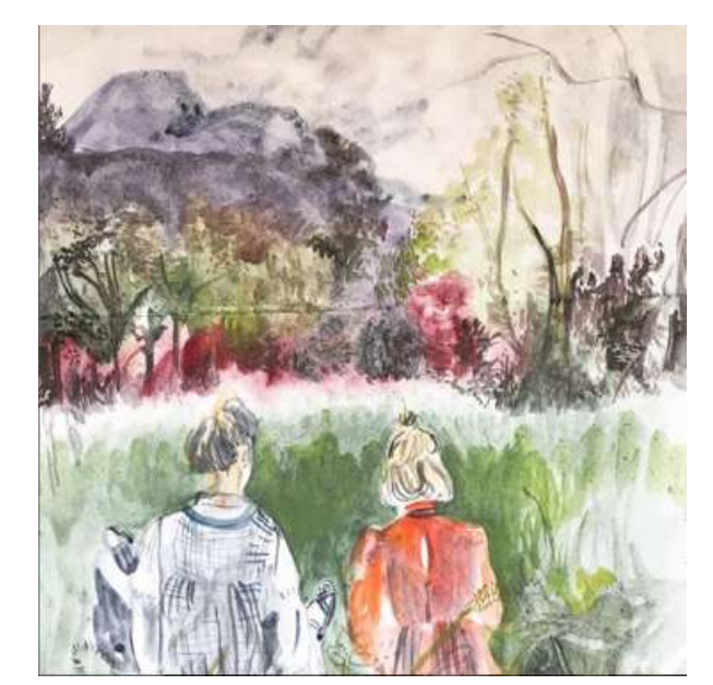
Sugar Loaf mountain, Wales, watercolour on paper