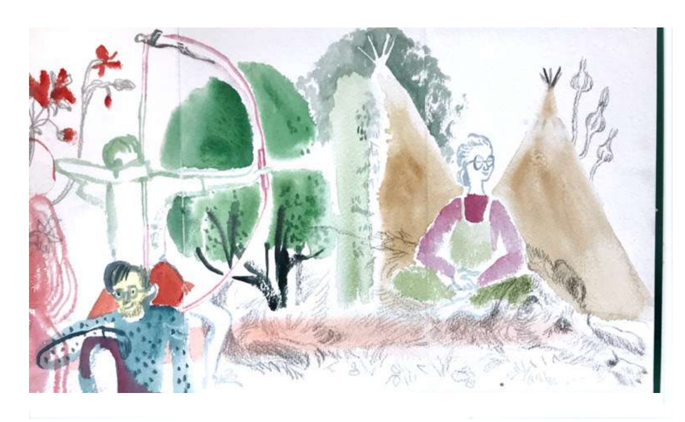
Pocket Festival, Talton Lodge, Oxfordshire