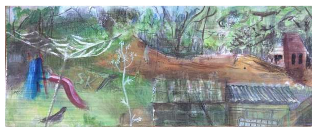
Devon garden, chalk and gouache on wood