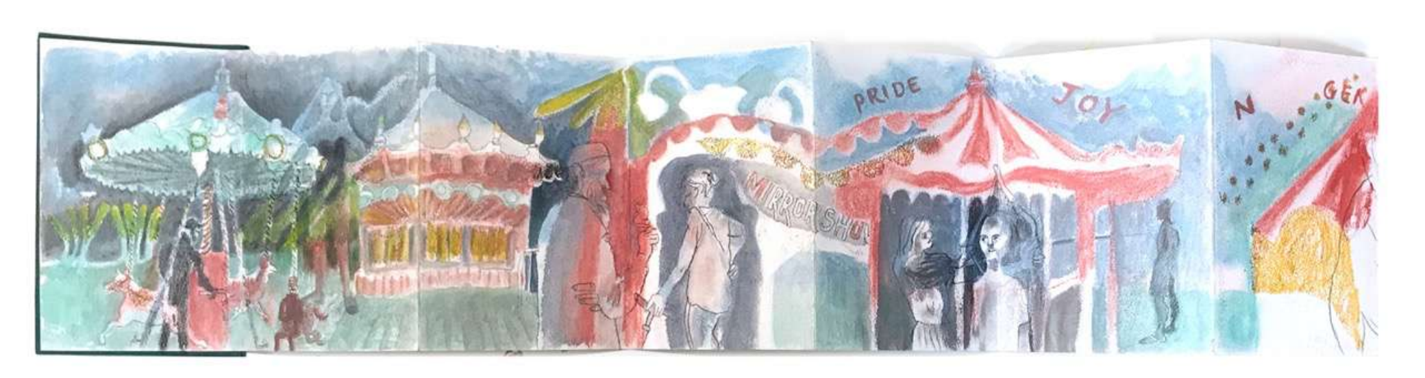
Carter's Travelling Steam Funfair chalk pastel and charcoal