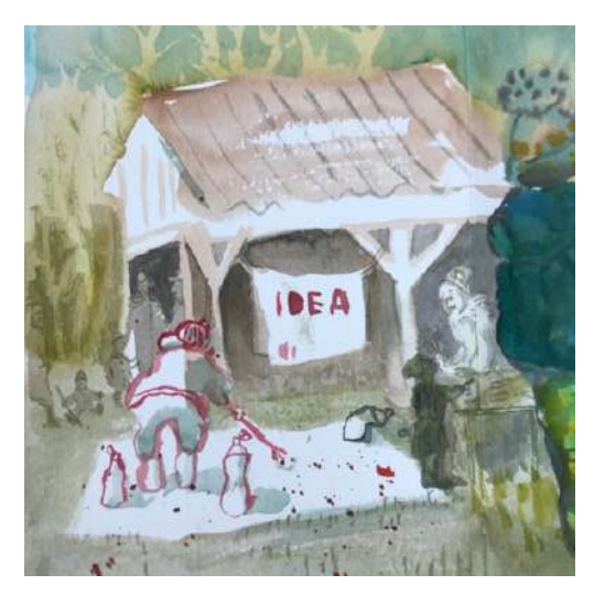
The Together Space. Mini-festival for children with and without additional physical and educational needs to come together and play freely.