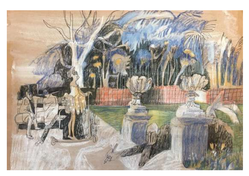
William Morris Museum, London, Ink and pencil on paper