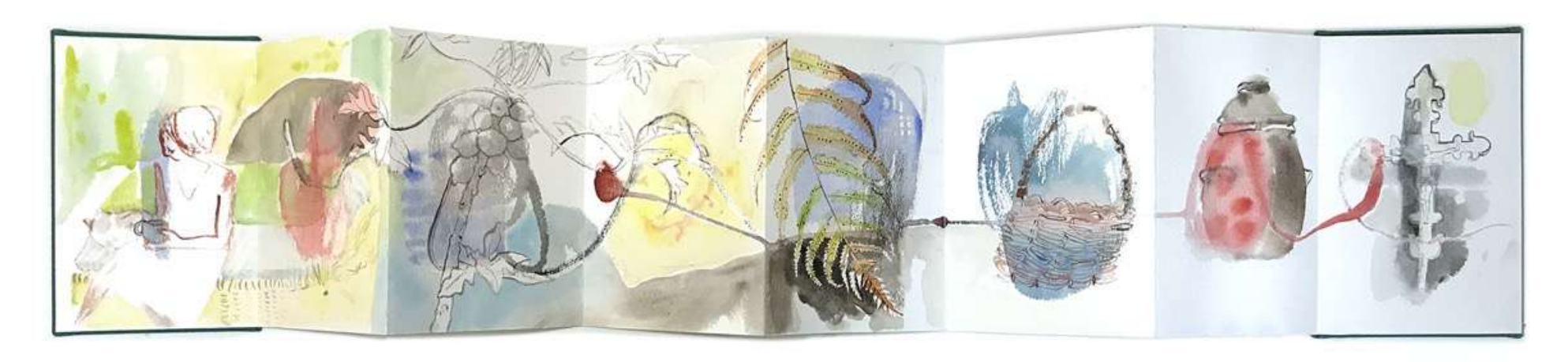
Hotel Pousada Paratí, Brazil Watercolour